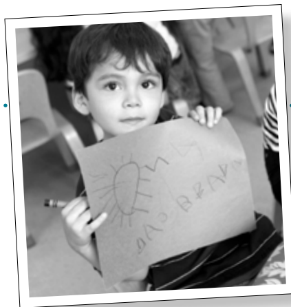
A boy in our Head Start program heading toward school readiness and success.