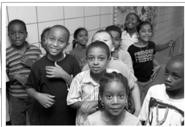
Our programs provide a safe haven from the streets, educational support, and a connection to caring adults.