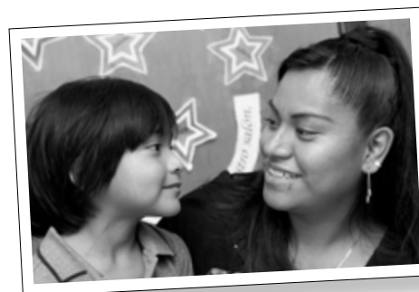
The Child Center always strives to strengthen the supportive bonds between parents and their children.

Strengthened 9,213 young people in our Youth Development division, with after-school programs, academic enrichment, sports, summer camp, vocational guidance, pregnancy prevention, college readiness, and a one-on-one tutoring program that helped 92 percent of 232 students improve their total reading scores by one or more grade levels.